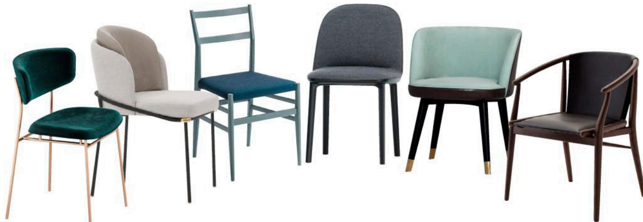
'Fifties' in 'Forest Green' velvet, £269, Calligaris (calligaris.com)

Entertain in style with seats designed to impress. With plush materials and cosseting shapes, they'll ensure your guests never want to leave the table