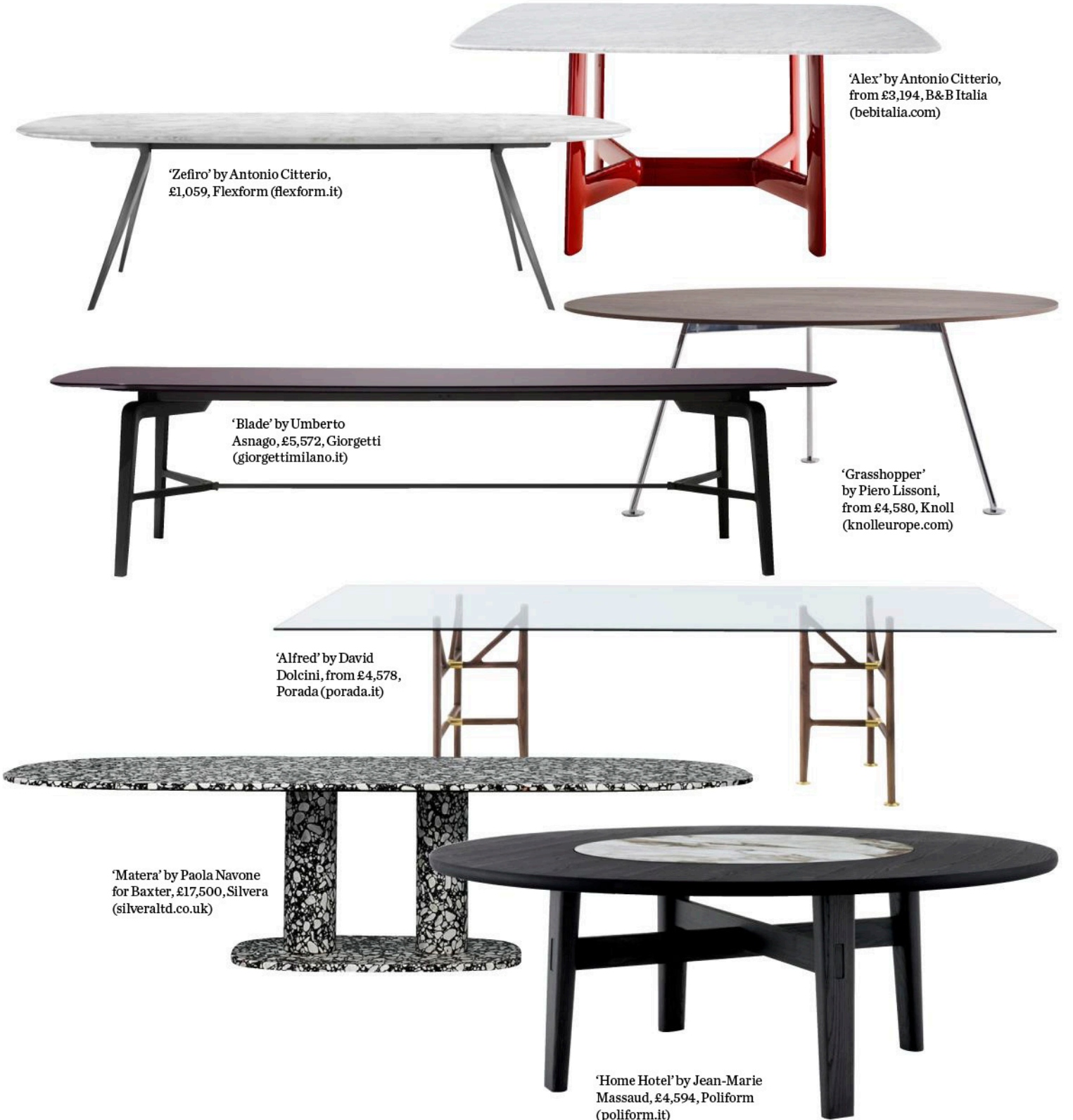
'Zefiro' by Antonio Citterio, £1,059, Flexform (flexform.it)

It's where family and friends gather, celebrate and feast, so your table should be the centrepiece of the home. Be sure yours will make an impression with these hot new designs