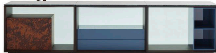
'Matrioska' by Piero Lissoni, from £2,140, Knoll (knolleurope.com)