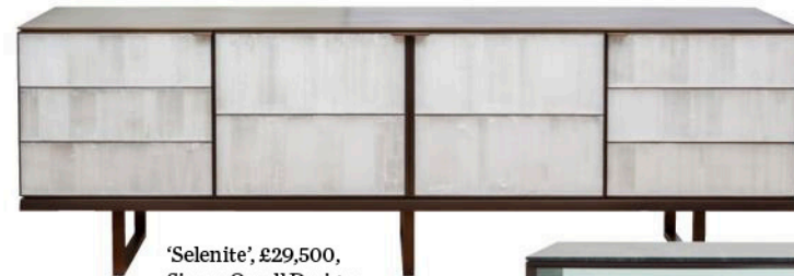
'Selenite', £29,500, Simon Orrell Designs (simonorrelldesigns.com)

No longer is this most useful of storage pieces designed to blend into the room. Architectural shapes and unusual materials are now key